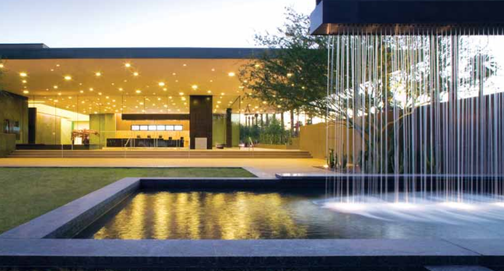
CAA Sale Weekend attendees will enjoy breakfast in Phoenix Art Museum's beautiful Sculpture Garden as part of the 2007 event.